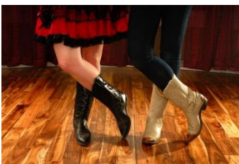
These Boots were Made for Dancin’

SESSION DETAILS MAY BE SUBJECT TO CHANGE